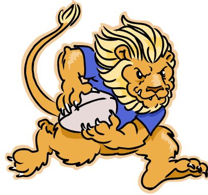
Log the lion