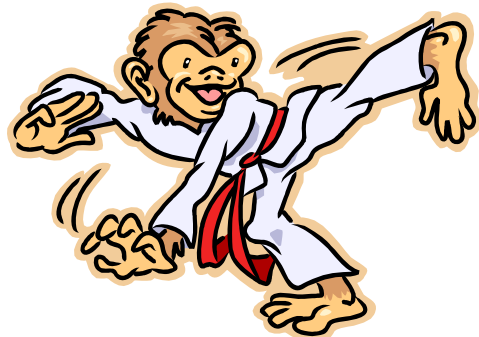
Mog the monkey