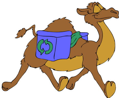
Cog the camel