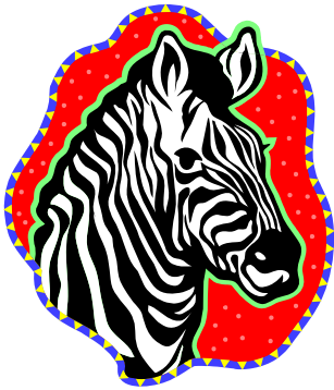
Zog the zebra