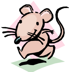
Eek-eek-eek the mouse